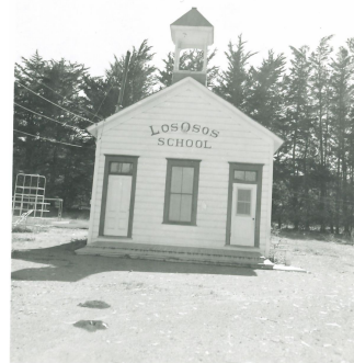
The Los Osos School as seen in 1959, shortly after it closed.

The Los Osos School District was established January 8, 1872. Built on Turri Road on the south side of Los Osos Valley Road, the schoolhouse measured 20 feet by 44 feet. Later, after the removal of the hothouse, a restroom was added to the rear of the original building. State appropriated funds for 1882 were $178, with an additional $19 for library expenses.