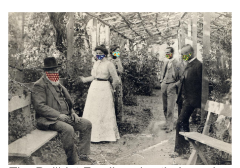
The Dallidet Family enjoy their garden with some, ahem, minor alterations