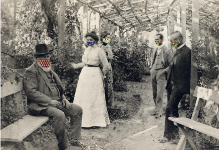
The Dallidet Family enjoy their garden with some, ahem, minor alterations

looking for some outdoor tranquility? Then you should visit the Dallidet Gardens.