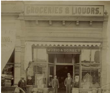
Muzio & Dorsey Groceries & Liquor in the 1880s