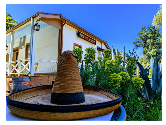
So much to do! Click here to learn more.

<u>Click here for more information or to get</u> your ticket.