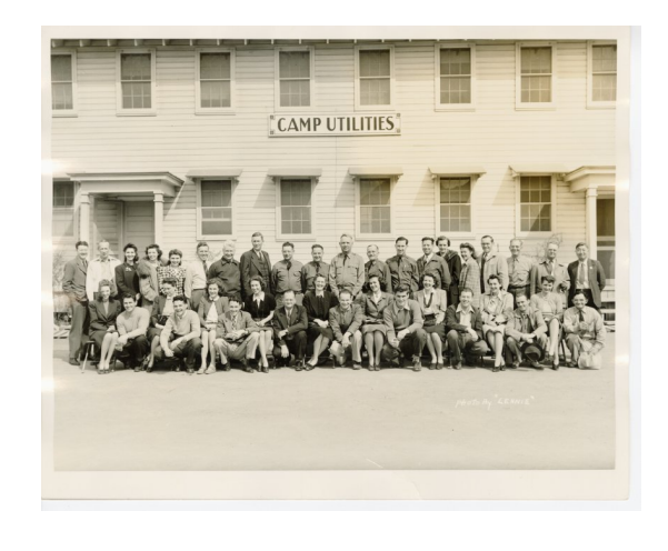
This photo shows civilian and military staff

This Veterans Day we thank all who have served our nation in uniform, living or deceased. It was originally known as Armistice Day and celebrated the end of World War I, which occurred on the 11th hour of the 11th day of the 11th month in 1918. The day was renamed Veterans Day in 1954.