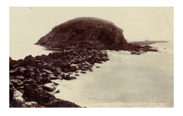
Breakwater and Whaler's Island at Port San Luis - Aug. 1913

The view from the Point, if one finds satisfaction in gazing upon water, can not be rivaled. To the left lies the spacious and splendid harbor of San Luis Obispo, walled in on three sides by lofty and rugged mountains that stand as a barrier between the placid waters and the strong northers that occasionally spring up inland. Facing the point reposes the mighty Pacific, which stretches away in the distance until the restless waters seem to blend with the azure sky.