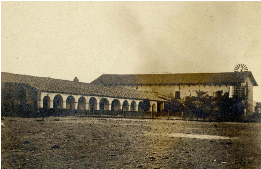
Mission San Miguel, likely photographed between 1890 and 1910