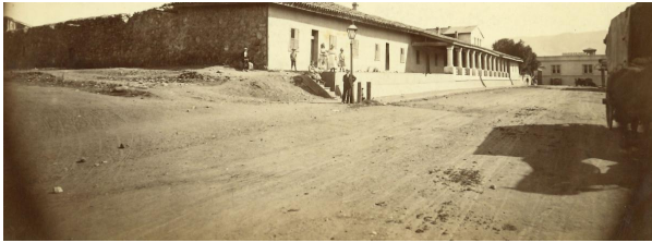
This 1886 photo shows a single gas lamp on the corner of Mission San Luis Obispo.

oftentimes hazardous, and pedestrians ran the risk of stepping into sidewalk holes, tripping over obstacles, finding themselves ankle-deep in mud, or taking an unexpected tumble into San Luis Creek.