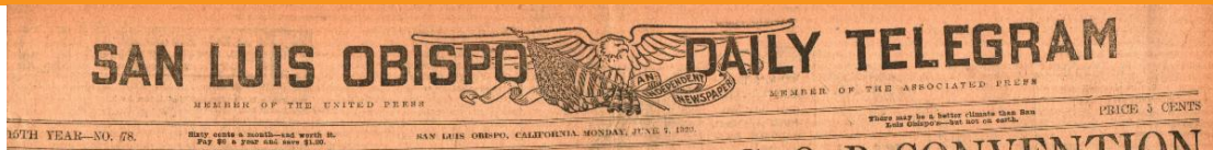
The masthead on August 7, 1920