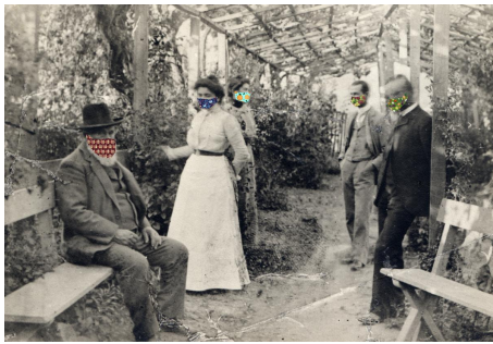
The Dallidet Family enjoy their garden with some, ahem, minor alterations