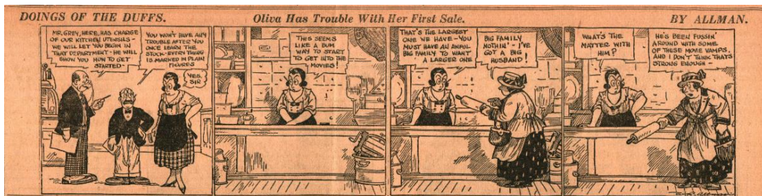
Comic strips have had a place in the papers since the beginning

To help illustrate this experience, we have chosen several clippings from the Daily Telegram of August 7, 1920, exactly one hundred years ago today.