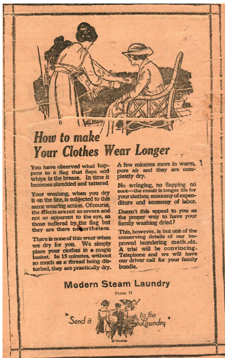
The latest in services offered.

We've been sharing stories from our county's past, vignettes of the people, places, and events that make up San Luis Obispo's history. One of our primary sources are the various Daily, Weekly, and Semi-Weekly newspapers that have served our community since the 1860s. Publications like the Breeze, the Telegram, the Telegram-Tribune, right on through to today's Tribune, have served as San Luis Obispo County's paper of record.